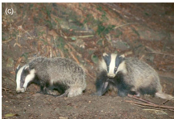
Figure 1 European badgers ( Meles meles ). In populations undisturbed by culling, badgers are highly social; disruption of this social behaviour is thought to lead to expanded ranging, and increased disease transmission both among badgers and from badgers to cattle.