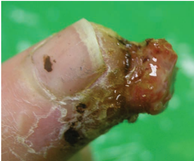
FIG 3: Verrucous lesion of cutaneous tuberculosis on the thumb of a veterinary surgeon